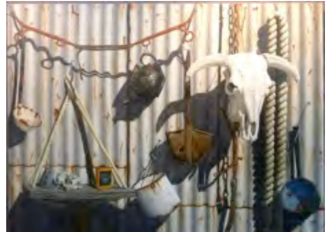
'Still Life Outback' Bendigo Bank Grand Prize Winner 2010