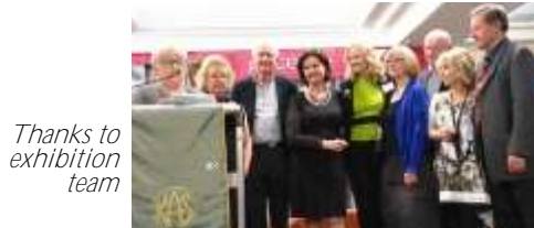
Thanks to exhibition team