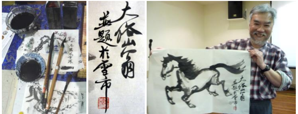
Guest Artist July ■ Franz Cheung

Franz took us on a wonderful cultural journey starting with the evolution of Chinese calligraphy. The earliest writing, dating from about 13c BC, was in the form of pictograms which were carved onto the back of turtle shells. Through the use of diagrams Franz showed how these symbolic pictures changed over the centuries to become the 'characters' or 'words' used today. The Chinese language does not have an alphabet or spelling but each single character consists of 'strokes', carrying individual meaning. There are 8 basic strokes which are to be done in a specific order involving 6 steps. There are also 2 forms of writing, the basic or 'formal' and 'action', but one has to master the 'formal' script before attempting the 'action'. Franz then moved onto show how the delicate brush strokes used in calligraphy are transferred into a painting.