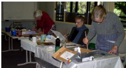
Elouera Group at work